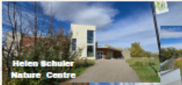
Helen Schuler Nature Centre